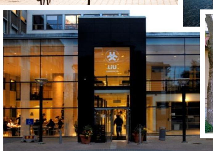
Campus US (University Hospital), Linköping, 3,000 students